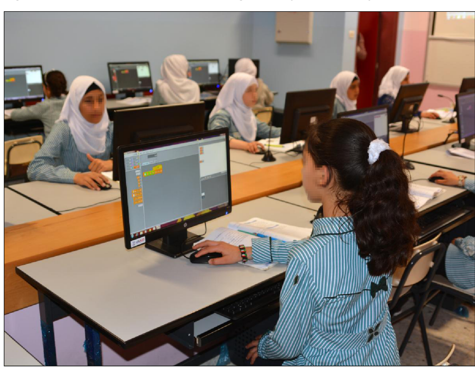
Figure 4: Palestinian Children Participating in a Project Funded by USAID

addressing this objective included those related to education, health, social and economic services, and protection of vulnerable populations. For example, one project that USAID is funding under this objective seeks to develop technical training and improve the quality of existing technical programs to support Palestinian career paths and link participants to employment opportunities. See figure 4 for an example of a project funded by USAID.