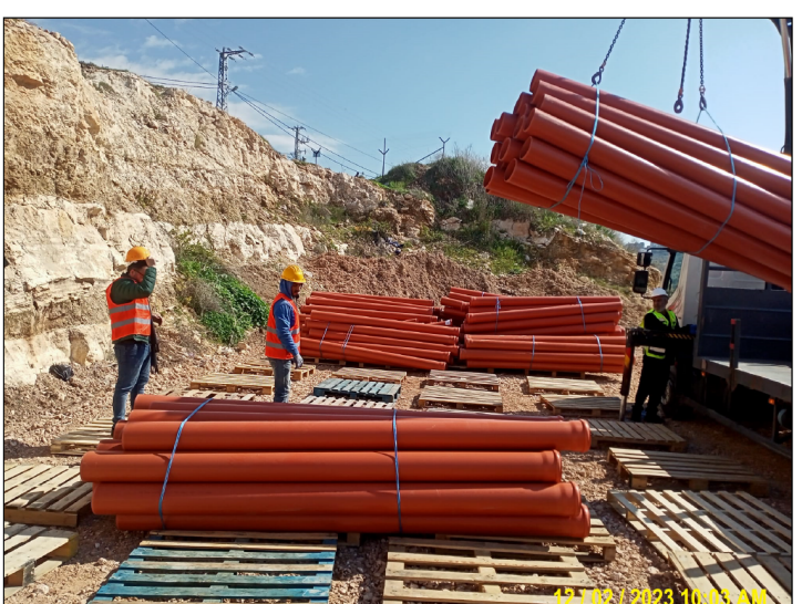
Figure 5: Workers at a Wastewater Collection System Improvements Project Funded by USAID

water, to improve household and community sanitation and enhance emergency preparedness. See figure 5 for an example of a project funded by USAID.