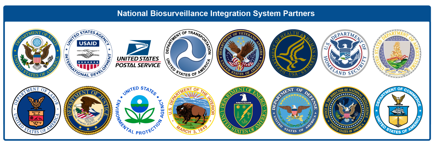
Figure 1: National Biosurveillance Integration System Federal Partners

Source: GAO analysis of National Biosurveillance Integration Center information and Advisory Board Charter, Department of State, United States Agency International Development, United States Postal Service, Department of Transportation, Department of Veterans Affairs, Department of Health and Human Services, Department of Homeland Security, United States Department of Agriculture, Department of Labor, Department of Justice, Environmental Protection Agency, United States Department of Interior, Department of Defense, Office of the Director of National Intelligence, Department of Commerce. | GAO-24-106142