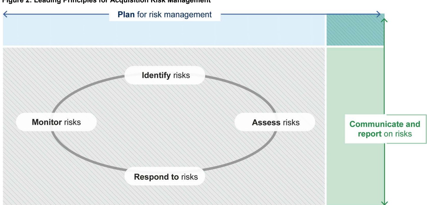
Figure 2: Leading Principles for Acquisition Risk Management

We identified six leading principles of acquisition risk management, which should occur systematically and iteratively at both the program level and portfolio level (see fig. 2).<sup>15</sup>