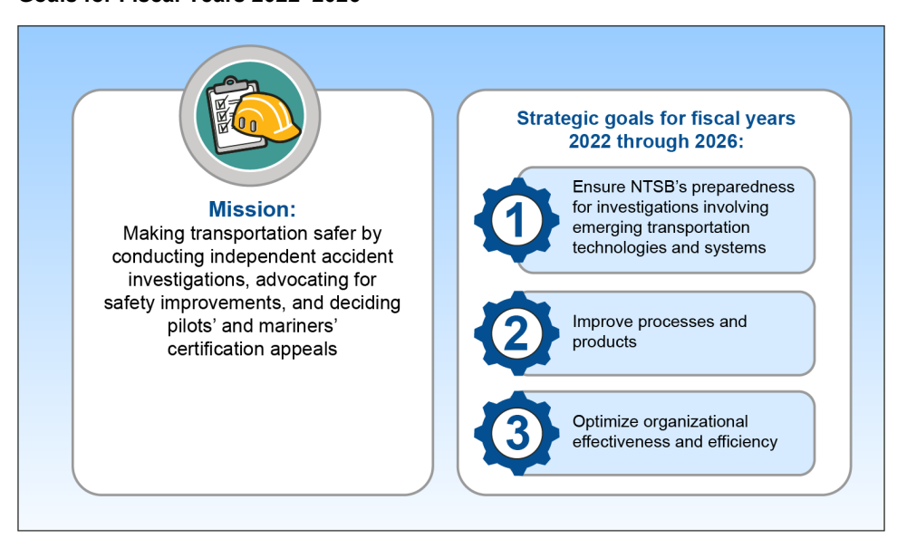
Figure 1: The National Transportation Safety Board's (NTSB) Mission and Strategic Goals for Fiscal Years 2022–2026

Source: National Transportation Safety Board, Strategic Plan Fiscal Year 2022-2026 (Washington, D.C.). | GAO-23-105853