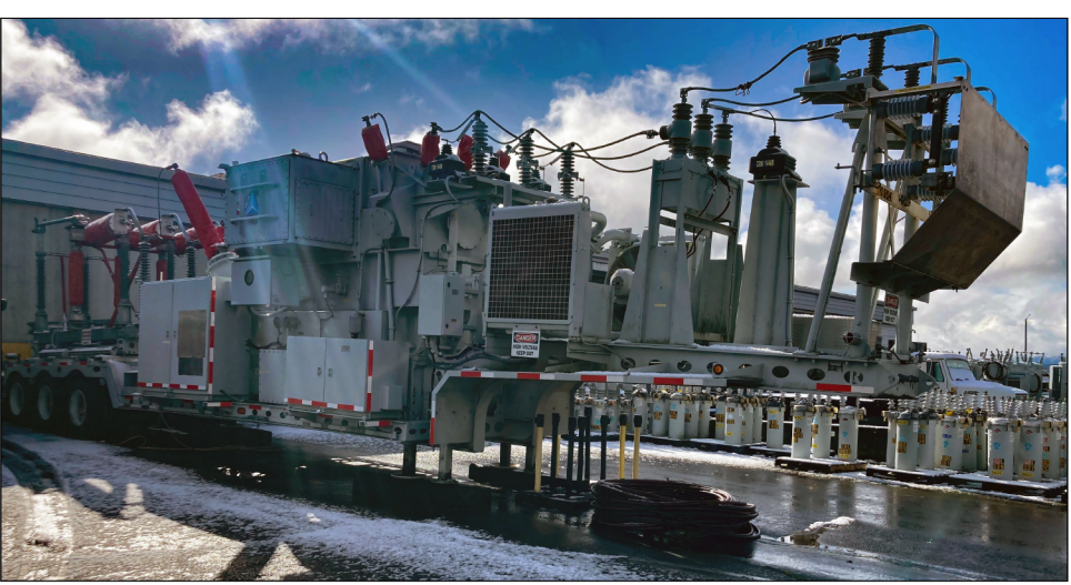
Figure 3. Example of a Mobile Substation

Given the challenges above, managing a limited inventory that may not meet demand for every utility would require decisions about who receives a transformer in an incident where multiple utilities suffer losses. However, smaller utilities we spoke with suggested that a strategic federal reserve of mobile substations—which include transformers—could provide a temporary stopgap while utilities acquired permanent replacements (see fig. 3 below for an example). Some of these officials told us that establishing a federal inventory of mobile substations would still face some of the challenges described above, depending on its configuration. Furthermore, utility officials described other ways the federal government could ensure adequate transformer reserves. For example, some officials suggested that federal entities, such as the power marketing administrations, could securely store privately owned spares on their property. Others suggested that the federal government could survey utilities to develop and share a comprehensive list of available spares nationwide.