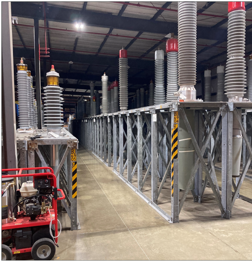
Figure 4: Spare Transformer Bushings Stored at a Utility Facility

spoke to maintained spare components, such as the bushings that allow the transformer to safely connect with power lines (see fig. 4).<sup>27</sup>