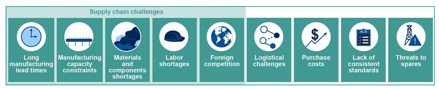
Figure 2. Challenges for Electric Utilities Attempting to Ensure Adequate Reserves of Transformers

Sources: GAO analysis of information from the Departments of Commerce and Energy and selected industry stakeholders. | GAO-23-106180