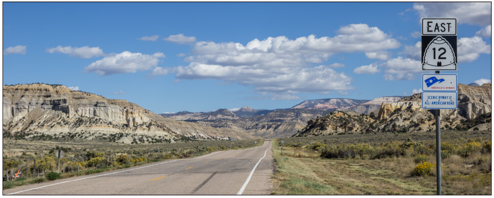
Highway 12 in Utah, an Example of a National Scenic Byway

GAO-23-105967