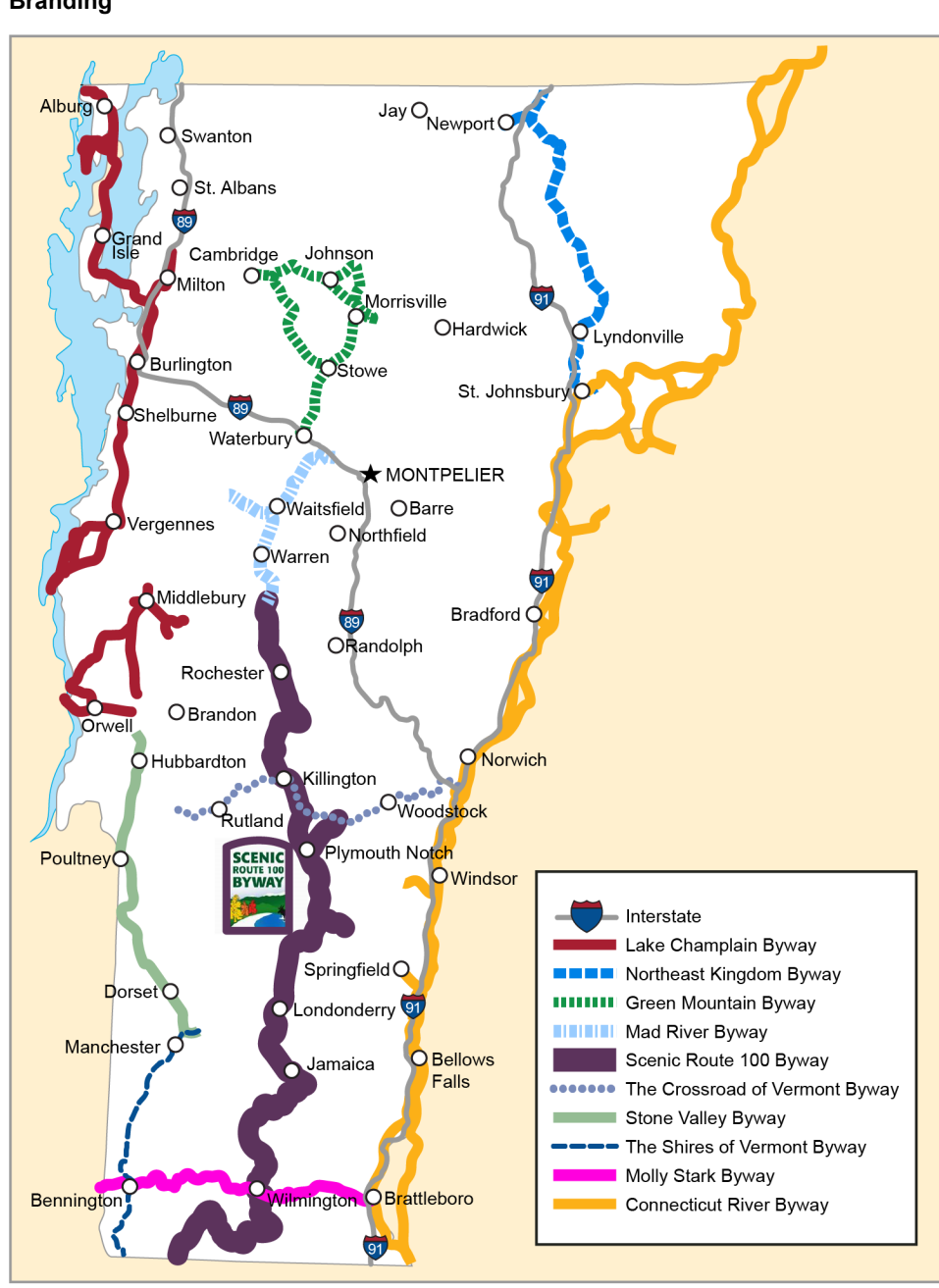
Figure 2: Federally-Designated Scenic Byways in Vermont and Example of Byway Branding

Source: GAO analysis of Vermont Department of Tourism and Marketing information and Map Resources. | GAO-23-105967