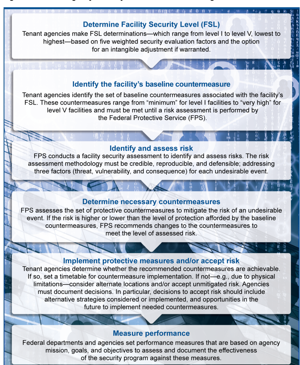
Figure 1: The Interagency Security Committee's Risk Management Process

Source: GAO analysis of Interagency Security Committee information. Image Montri/stock.adobe.com. | GAO-23-105649