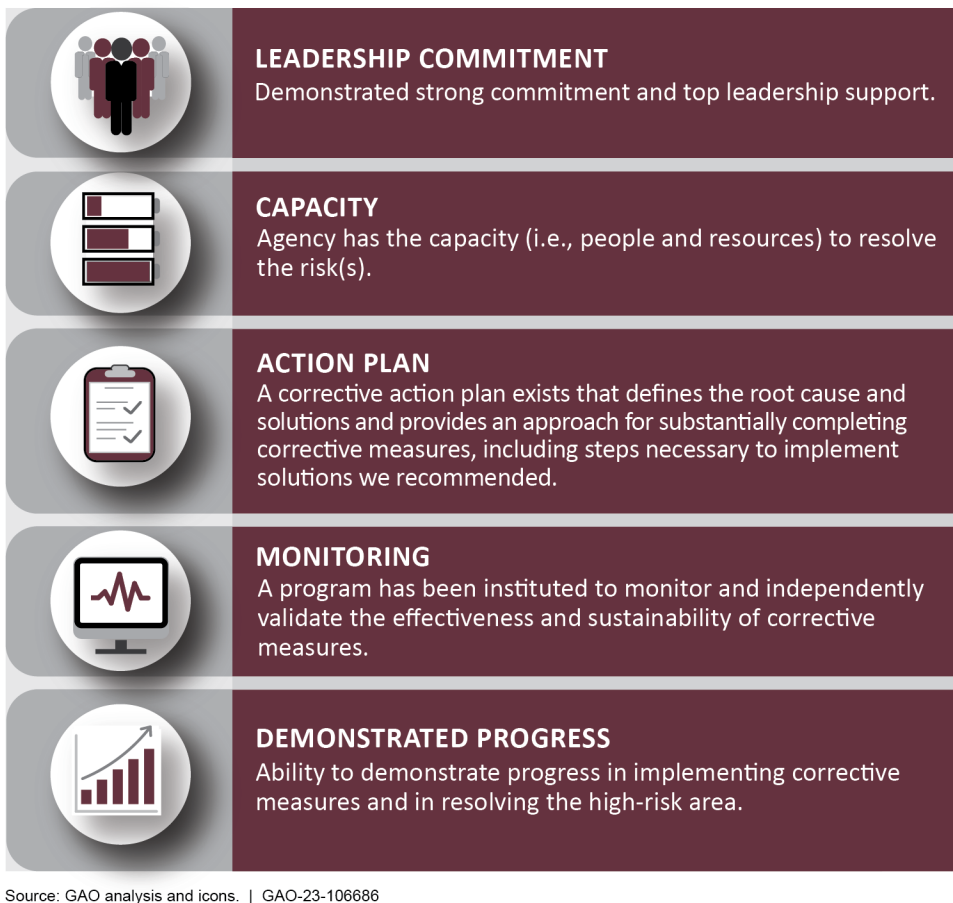
Figure 2: Criteria Essential to Addressing High-Risk Areas