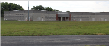
An enclosed recreation field linked to inmate housing blocks, taken from inside the field's fence.

GAO-23-105082