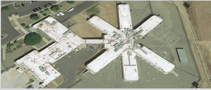
Marine Corps Installations—West, Camp Pendleton Base Brig, Camp Pendleton, CA

The Marine Corps assesses adherence to health and safety standards through command-led inspections and Inspector General Inspections. It also uses ACA and PREA audits as external assessments of its MCFs.