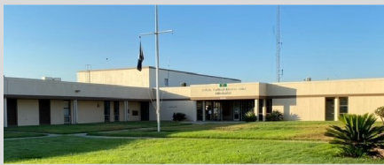
Naval Consolidated Brig Miramar, CA