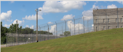
A double fence with three strands of concertina wire and a surveillance system surrounds the facility's perimeter.

The Army's United States Disciplinary Barracks at Fort Leavenworth, KS is the Department of Defense's only Level III military correctional facility for male incarcerated persons. It is a maximum security facility that confines those with sentences longer than 10 years, including life imprisonment and confinement awaiting death sentence. With a total operational capacity of 460, the facility had a population of 395 as of December 31, 2021, the most recent data available.