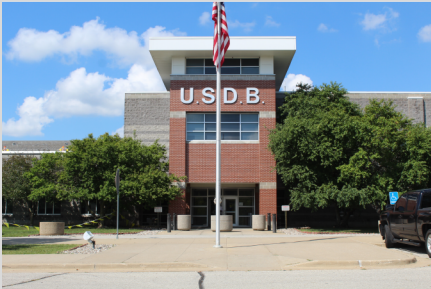
United States Disciplinary Barracks, Fort Leavenworth, KS

The Army's United States Disciplinary Barracks at Fort Leavenworth, KS is the Department of Defense's only Level III military correctional facility for male incarcerated persons. It is a maximum security facility that confines those with sentences longer than 10 years, including life imprisonment and confinement awaiting death sentence. With a total operational capacity of 460, the facility had a population of 395 as of December 31, 2021, the most recent data available.