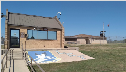
Air Force's Joint Base San Antonio-Lackland Military Correctional Facility, Joint Base San Antonio, TX

The Joint Base San Antonio-Lackland military correctional facility (MCF) is the largest of the Air Force's 19 Level I MCFs, with beds for 31 incarcerated persons and six segregation cells. The facility is capable of housing service members awaiting trial, as well as post-trial incarcerated persons with sentences of up to 1 year. The administrative office (foreground) and the MCF, enclosed by a single perimeter fence, are shown in the image above.