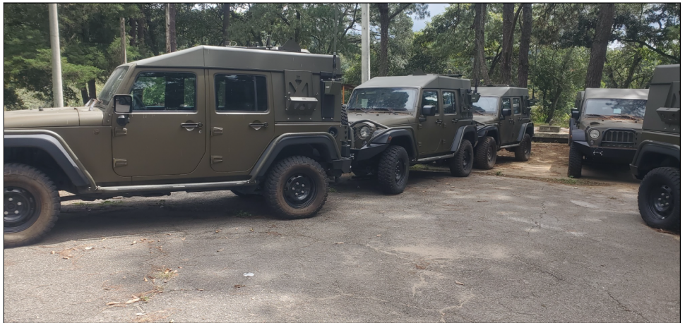
Figure 2: Jeeps Provided by DOD to the Government of Guatemala

GAO-23-105856