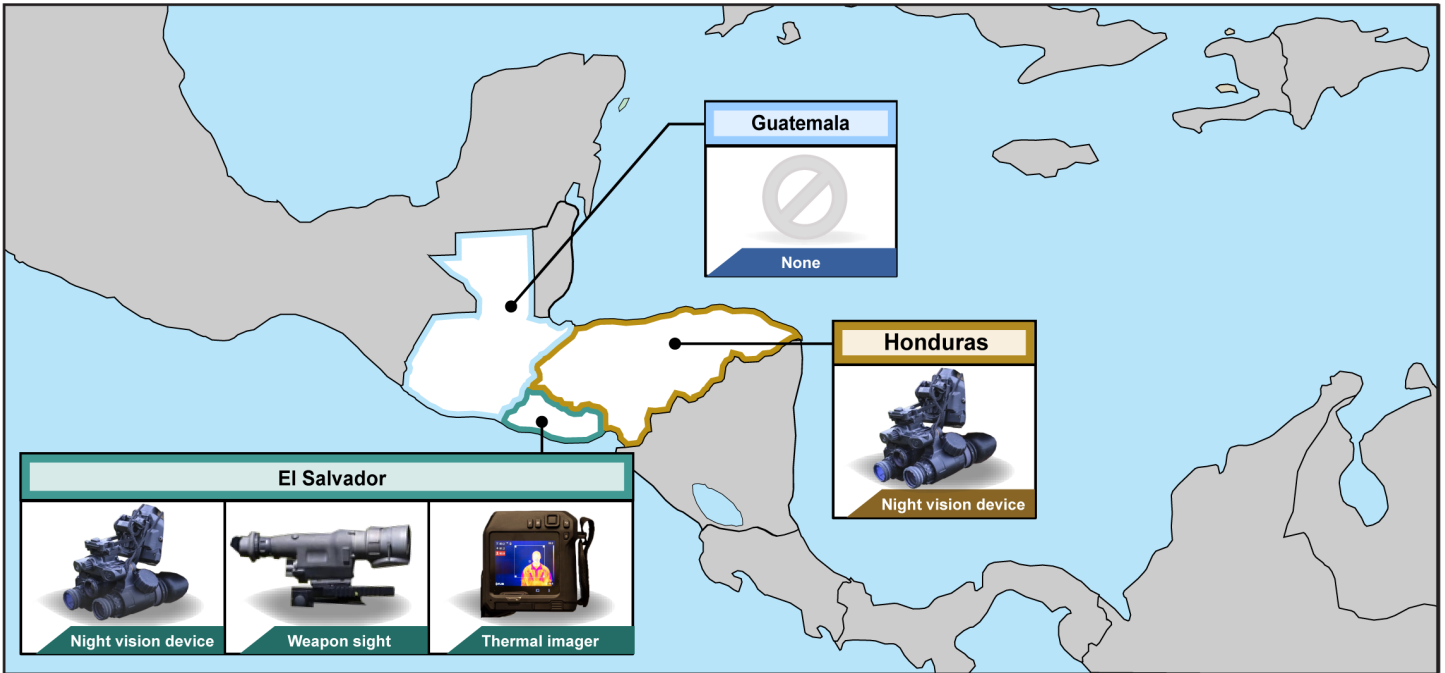
Figure 4: Examples of Equipment Types DOD Provided Northern Triangle Countries That Are Subject to Enhanced End-Use Monitoring

Source: GAO analysis of Department of Defense (DOD) documentation. | GAO-23-105856