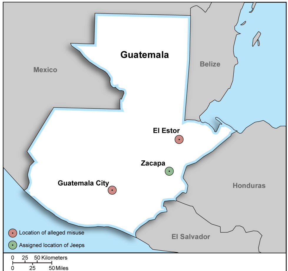
Figure 3: Locations in Guatemala of Alleged Misuse Involving DOD-Provided Jeeps

GAO-23-105856