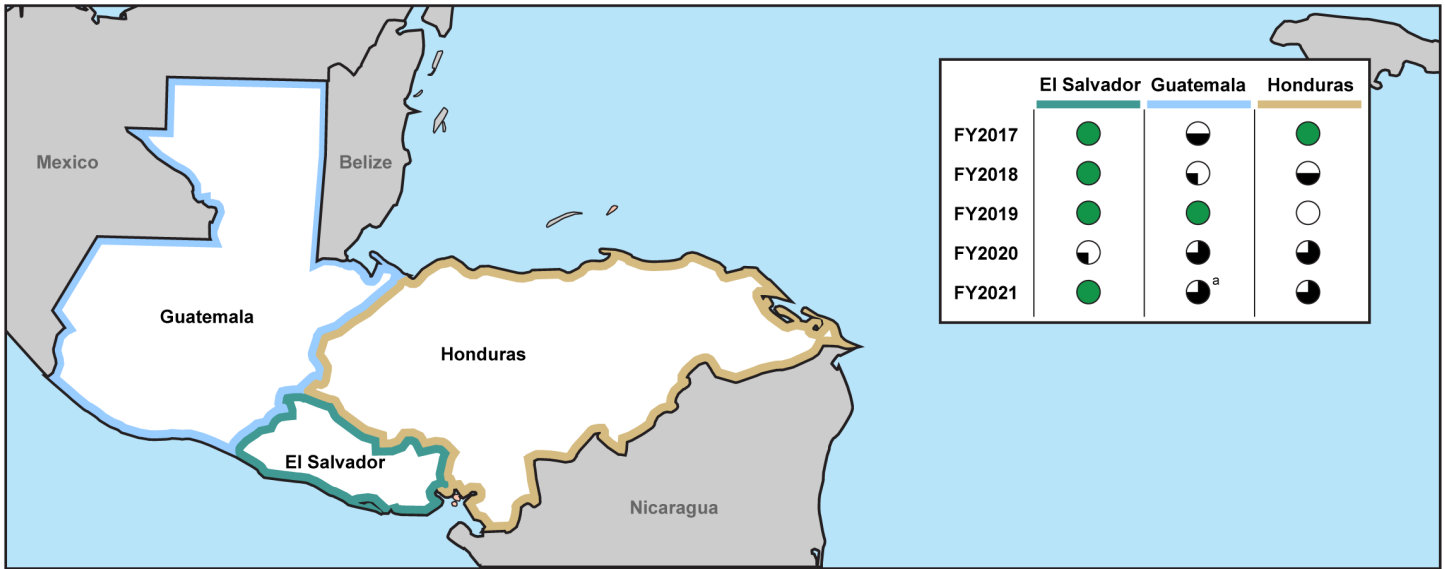
Figure 6: Number of Quarters in Which DOD Completed Routine End-Use Monitoring in Each Country

○ = No checks completed ◐ = Checks completed in 1 of 4 quarters ◑ = Checks completed in 2 of 4 quarters ◒ = Checks completed in 3 of 4 quarters ● = Checks completed in all 4 quarters