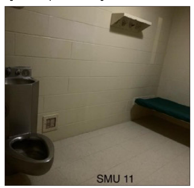
Figure 1: Examples of U.S. Immigration and Customs Enforcement (ICE) Segregated Housing Cells in Detention Facilities