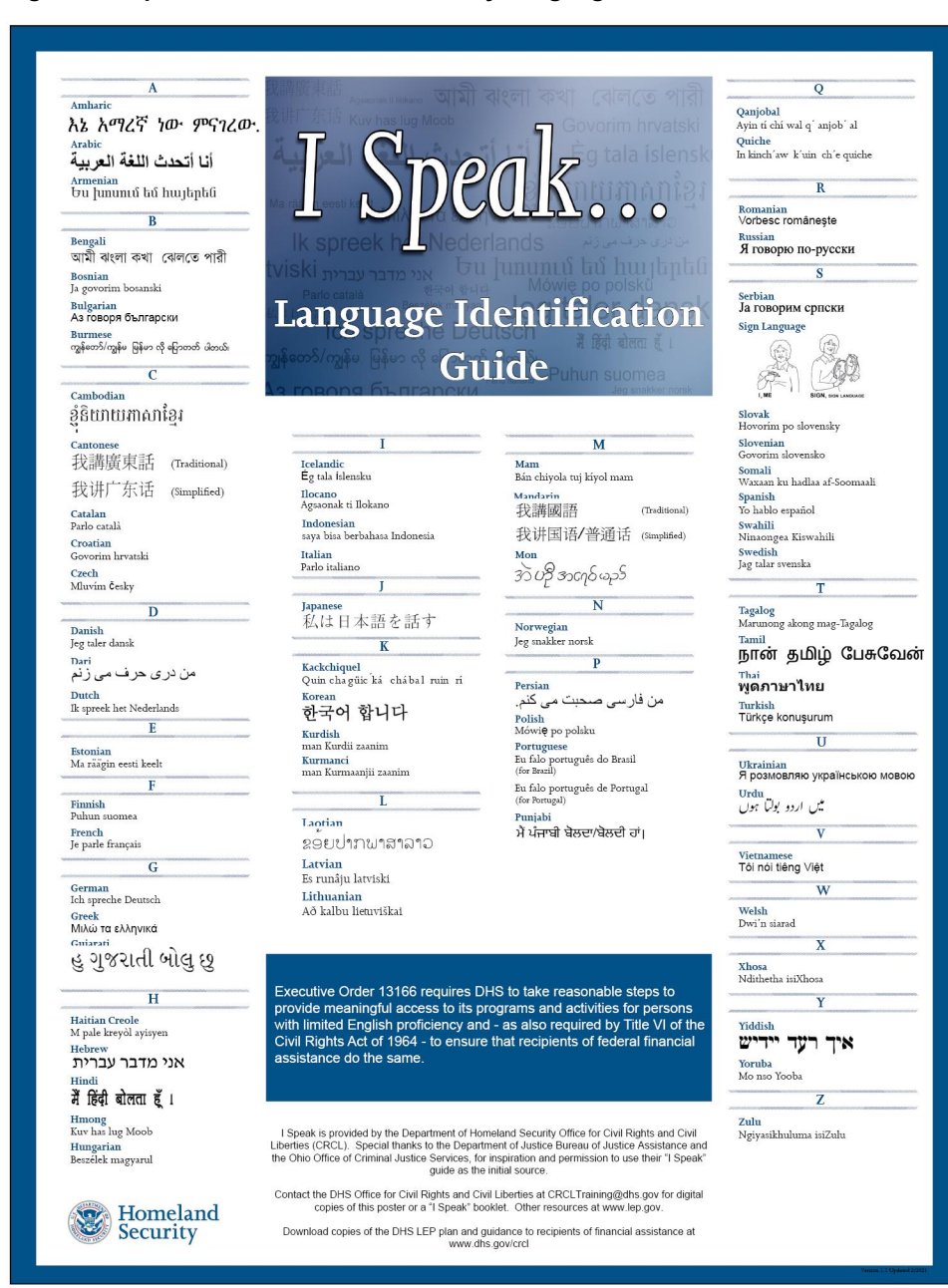
Figure 2: Department of Homeland Security Language Identification Guide Poster

GAO-23-105196