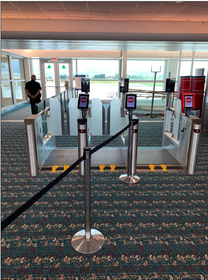
Figure 1: Examples of Cameras Used for Air Exit Facial Recognition