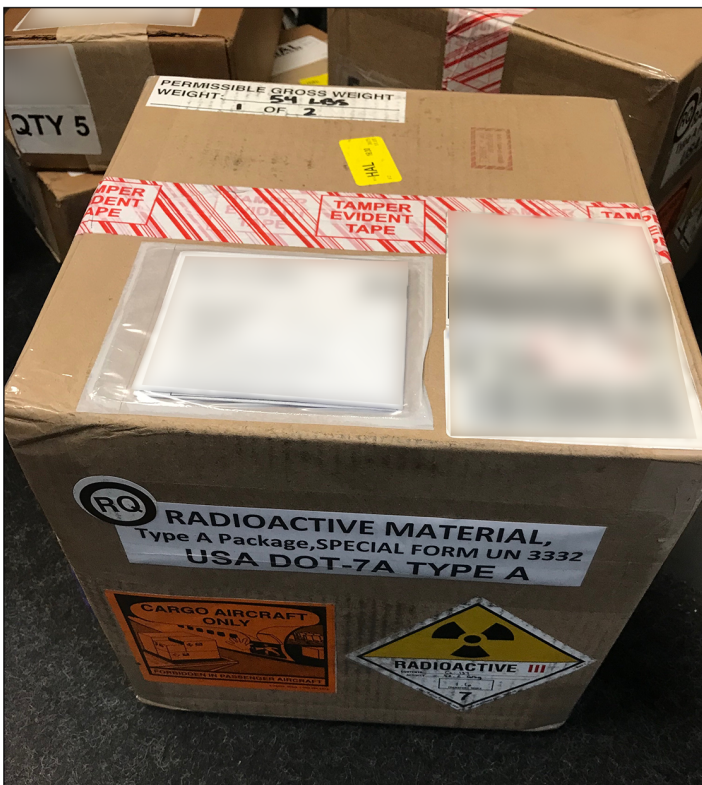
Figure 1: Photos of the High-Risk Radioactive Materials Purchased Using Fraudulent Licenses and Delivered to GAO's Shell Company (photos from November 2021 and March 2022)

To make our purchase, GAO investigators provided a copy of a license that we forged to two vendors and subsequently obtained invoices; paid the companies; had the material shipped for pickup by a representative of our shell company (actually, one of GAO's investigators); and confirmed delivery of the material. The material shipped to us from our two purchases is shown in figure 1.