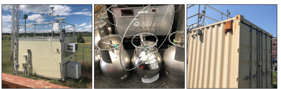
(Left to right) National Core network (NCore) monitoring site; canisters used to collect samples for measuring air toxics; near-road monitoring site.

Examples of Monitoring Sites in the National Ambient Air Quality Monitoring System