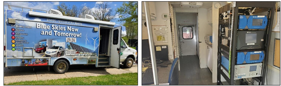
Figure 1: Example of a Mobile Air Quality Monitoring Unit