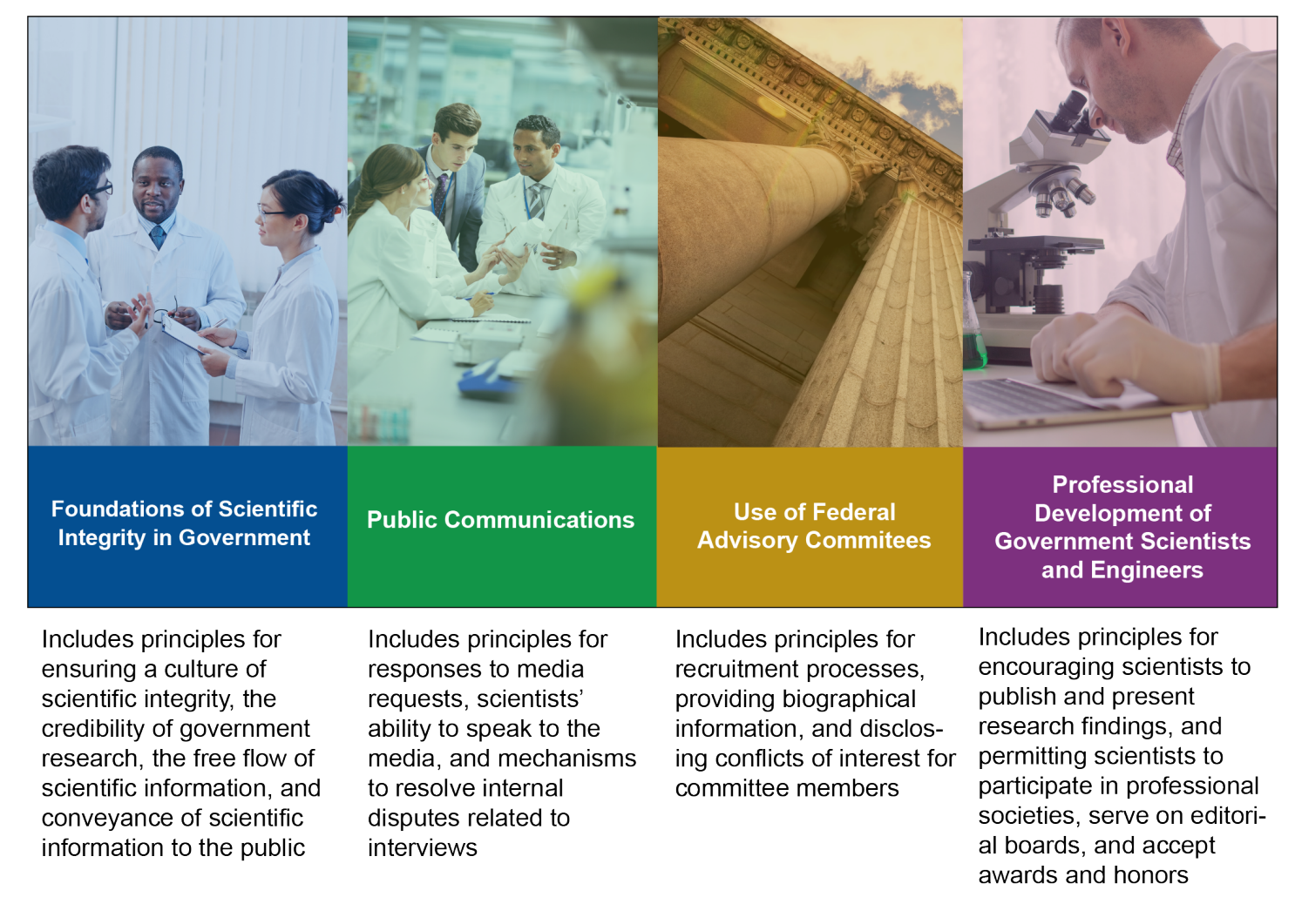
Figure 2: Pillars of Scientific Integrity as Defined by the Office of Science and Technology Policy (OSTP)

Sources: GAO (analysis), OSTP (information), PaulBradbury/koto/pressmaster/merrvas/Khwanchai/stock.adobe.com (images). | GAO-22-104613