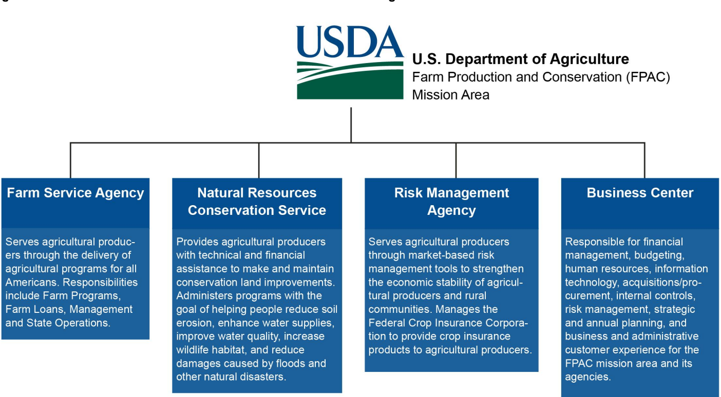
Figure 1: USDA Farm Production and Conservation Mission Area Organization

Source: GAO summary of Farm Production and Conservation mission area data. | GAO-21-512