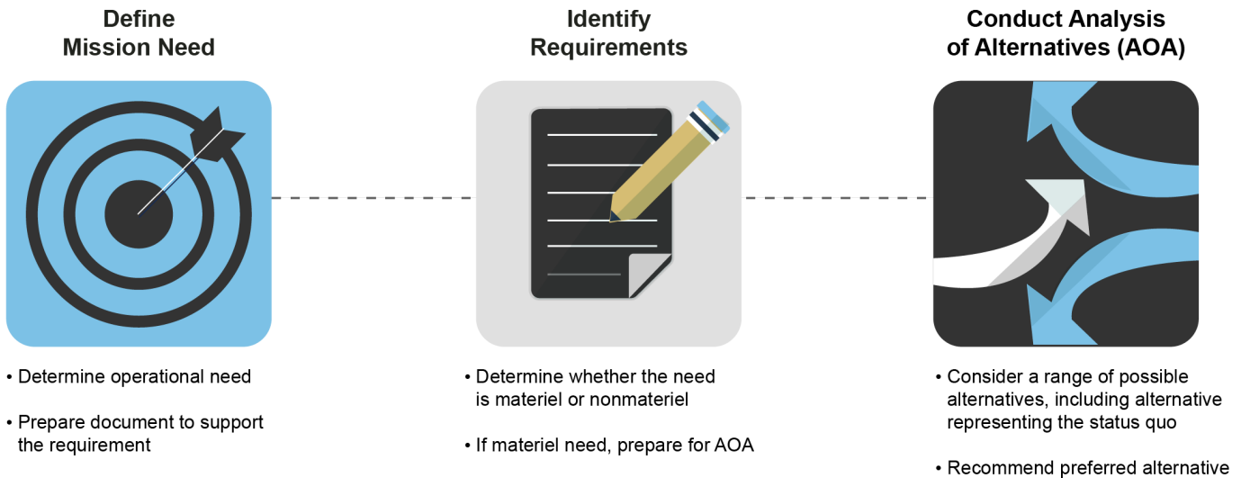
Figure 4. Elements of the Joint Capabilities Integration and Development System Process

Source: GAO's analysis of Manual for the Operation of the Joint Capabilities Integration and Development System, 2018. | GAO-21-105283