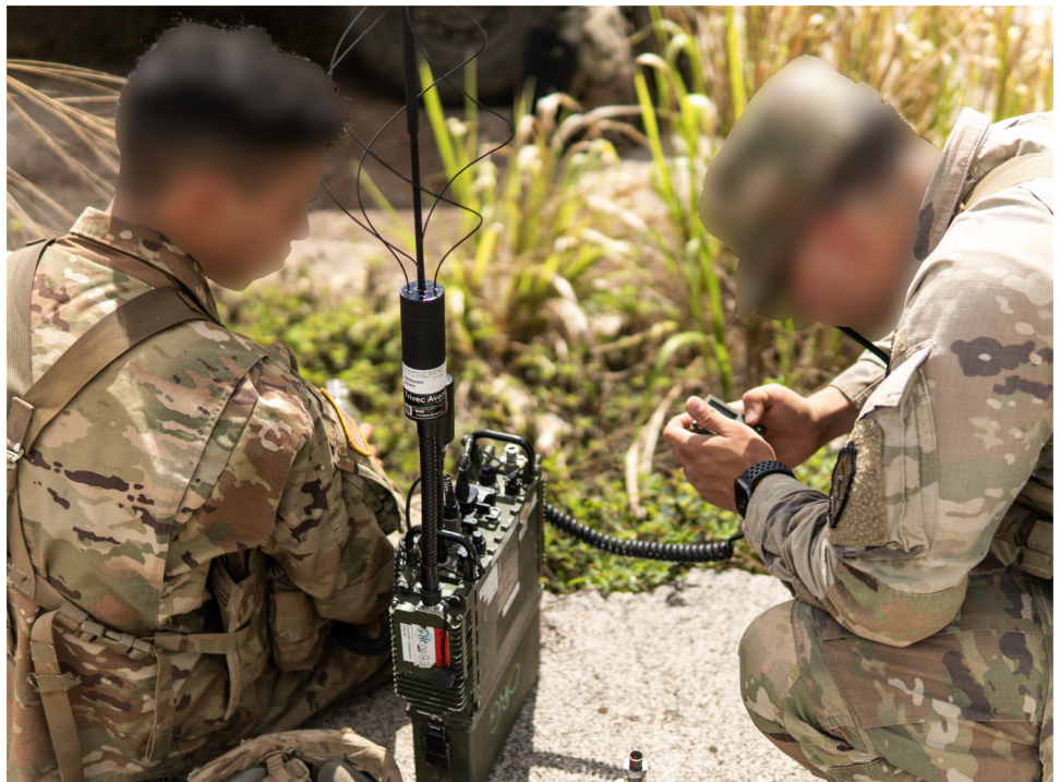
Figure 2: Army Soldiers Using a Mobile User Objective System-Compatible Portable Terminal

GAO-21-105283