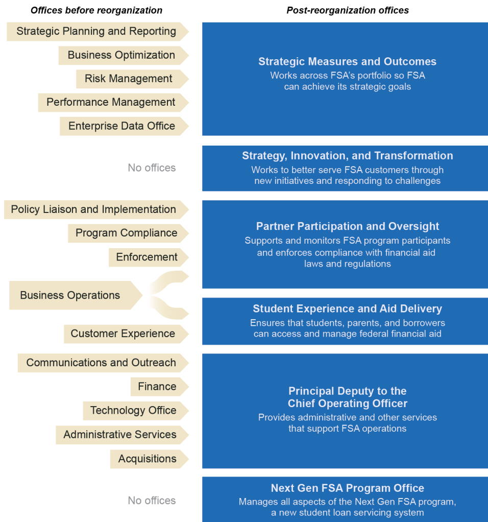
Figure 3: Office of Federal Student Aid’s (FSA) March 2020 Reorganization of Offices

Source: GAO analysis of FSA documents. | GAO-21-542R