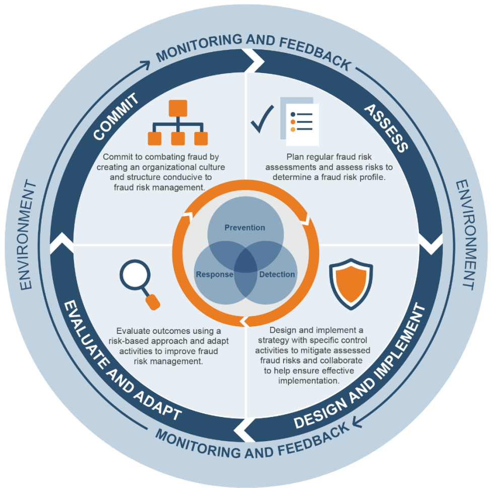
Figure 1: A Framework for Managing Fraud Risks in Federal Programs