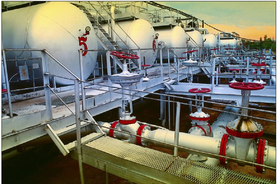
Figure 1: Chemical Facility Storage Tanks

Source: Department of Homeland Security. | GAO-21-12