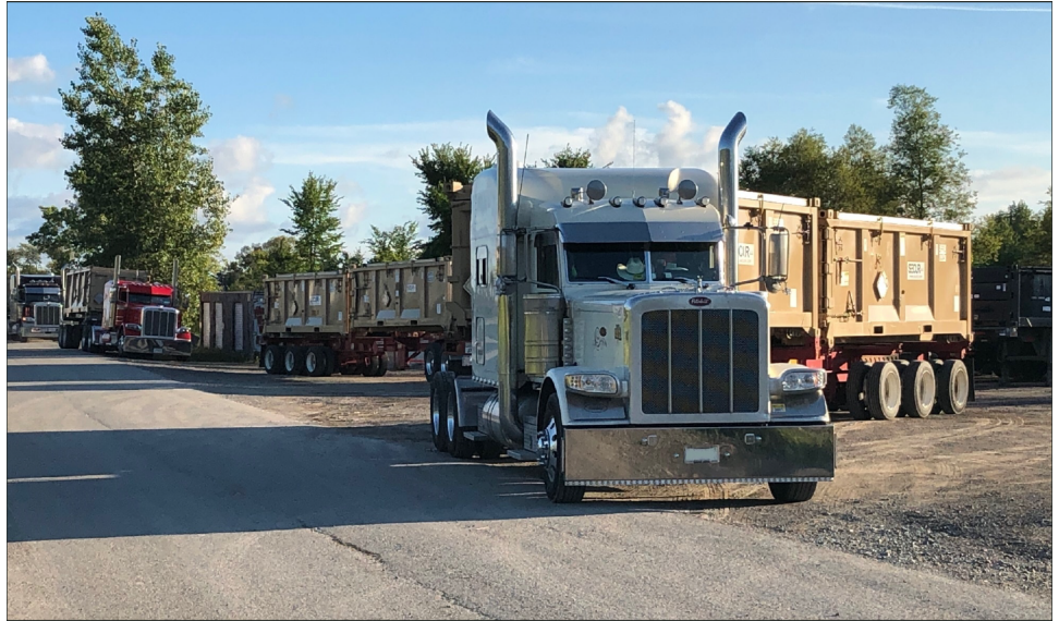
Figure 3: Low-Level Waste from the West Valley Demonstration Project Being Transported for Off-Site Disposal, August 2020

Source: West Valley Demonstration Project. | GAO-21-115