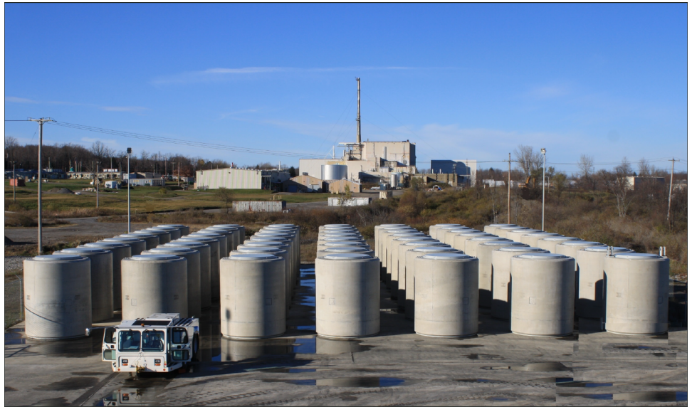
Figure 4: High-Level Waste from the West Valley Demonstration Project in Interim On-Site Storage, March 2017

Source: West Valley Demonstration Project. | GAO-21-115