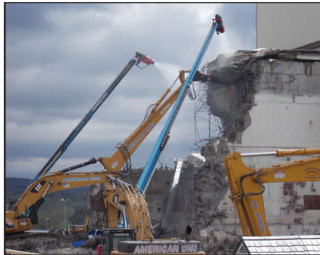
During demolition, June 2018