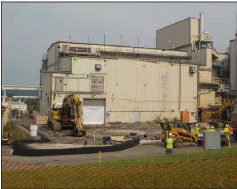
Before demolition, September 2017