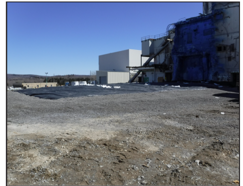
After demolition, September 2018

Source: West Valley Demonstration Project. | GAO-21-115