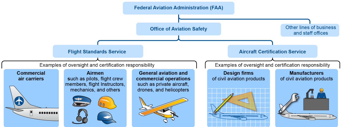
Figure 1: Examples of Industry Segments That the Flight Standards Service and Aircraft Certification Service Certify and Oversee

Source: GAO analysis of Federal Aviation Administration information. | GAO-21-94