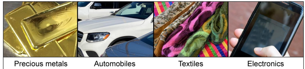
Figure 3: Examples of Goods Commonly Used in Trade-Based Money Laundering Schemes