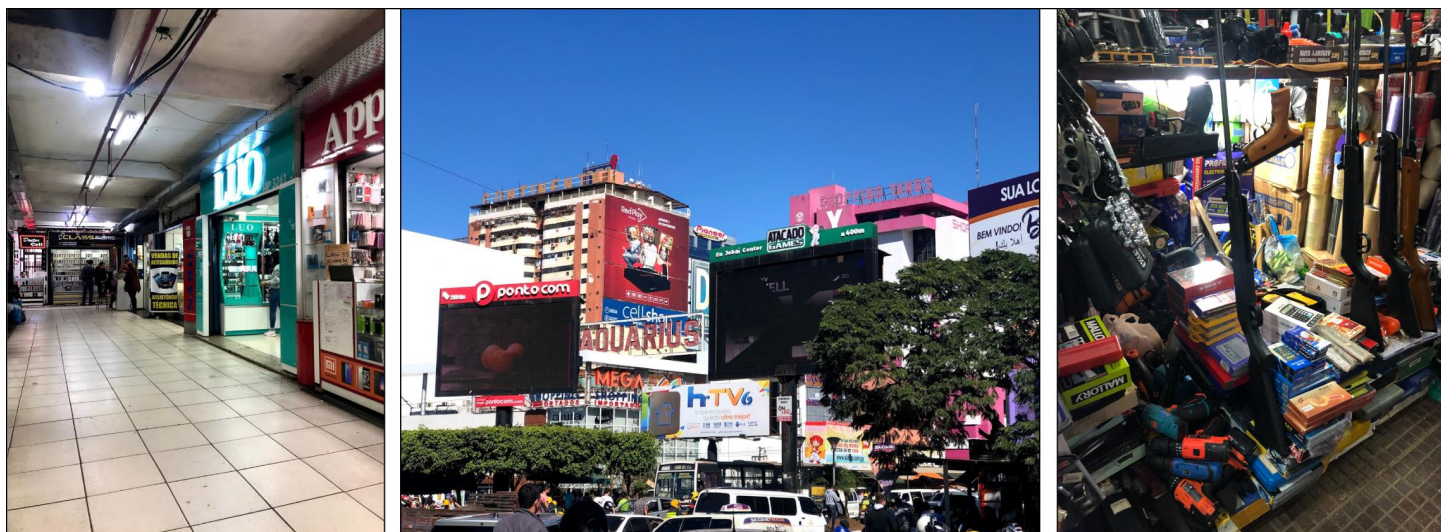
Figure 4: Photos of Commercial Activity in Ciudad del Este, Paraguay in the Tri-Border Area