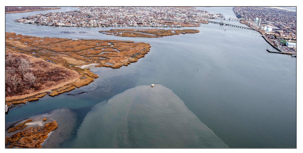
Figure 1: Sewage Overflow in Western Long Island South Shore Estuary from Bay Park Sewage Treatment Plant in East Rockaway, New York after Hurricane Sandy, 2012

simultaneously or consecutively that lead to an extreme impact-have a multiplying effect on the risk to drinking water and wastewater infrastructure systems. Compound extreme events can also increase the risk of cascading infrastructure failure since some infrastructure systems rely on others and the failure of one system can lead to the failure of interconnected systems.<sup>53</sup> This includes a water infrastructure system relying on the energy sector for power to operate pump stations and drinking water and wastewater treatment facilities. For example, during Hurricane Sandy in 2012, extreme rainfall coincided with high tides creating a storm surge. Hurricane Sandy caused power outages and flooding at eight of New York City's 14 wastewater treatment facilities and 42 of the city's 96 pumping stations. Further, power outages and flooding of wastewater treatment facilities and the large influx of floodwater in the sewer system resulted in the release of approximately 562 million gallons of untreated and diluted sewage into local waterways, as shown in figure 1.