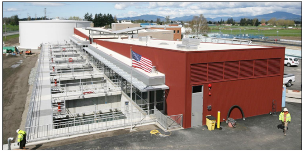
Figure 4: New Waterproof Drinking Water Treatment Plant, City of Anacortes Public Works

appropriate to use for their regions and locales. For example, Anacortes Public Works (Anacortes, Washington) worked with the Skagit Climate Science Consortium—a nonprofit organization—to conduct a climate risk assessment for their drinking water system.<sup>65</sup> Anacortes Public Works used the initial climate risk assessment to implement projects that will increase their resilience to the most significant effects from climate-related impacts, flooding, and increased sediment levels in their water supply (see fig. 4). Anacortes Public Works plans to work with the consortium again to better understand how rising sea levels and increasing salinity levels will affect their drinking water supply in the future. A few utilities said that technical assistance efforts should be a collaborative process between the utilities using climate information to make decisions and the scientists providing the technical assistance to ensure that climate information and models are what drinking water and wastewater utilities need to plan for climate resilience.