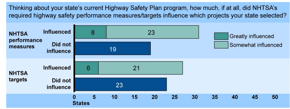
Figure 2: State-Reported Use of National Highway Traffic Safety Administration (NHTSA) Performance Measures and Targets to Select Projects

performance measures can be used to allocate resources towards the most pressing safety issues.<sup>39</sup>