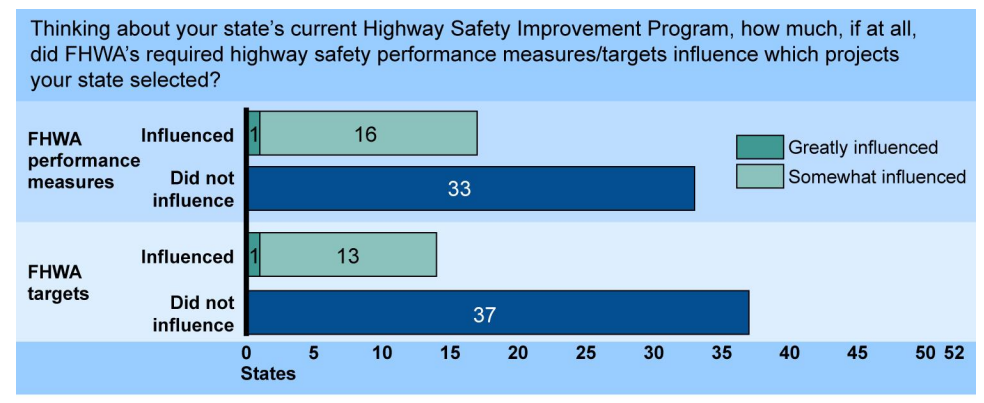
Figure 3: State-Reported Use of Federal Highway Administration (FHWA) Performance Measures and Targets to Select Projects