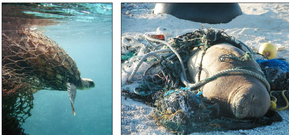
Figure 2: Marine Life Entangled in Derelict Fishing Gear

GAO-19-653