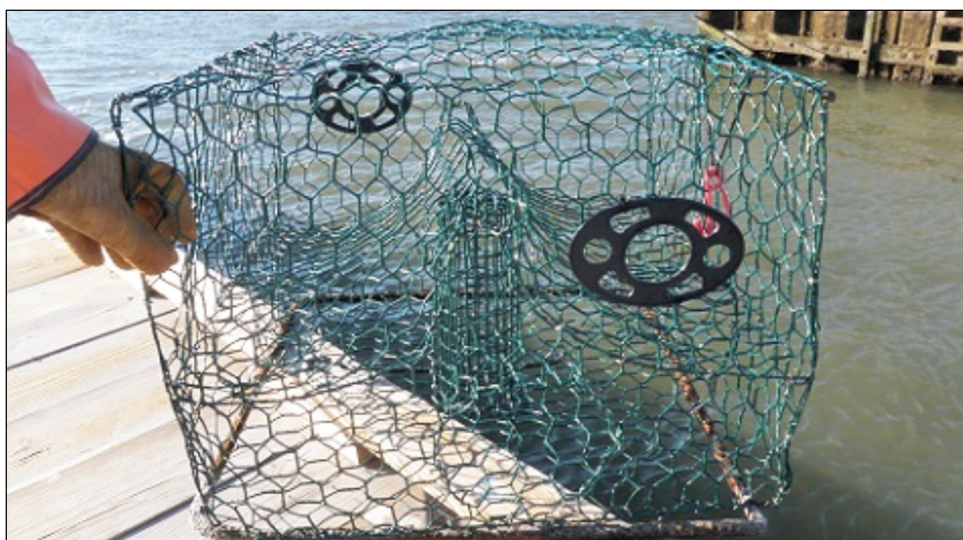
Figure 4: Crab Trap with Biodegradable Escape Mechanism

Source: Virginia Institute of Marine Science. | GAO-19-653