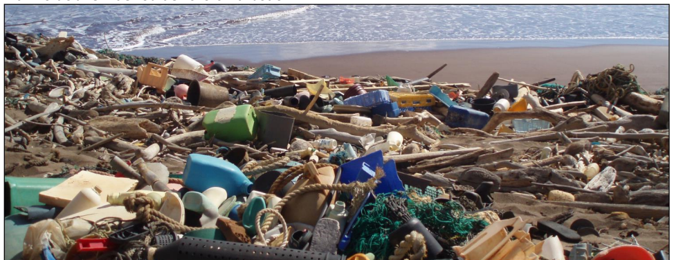
Marine debris washed ashore on a beach

GAO-19-653