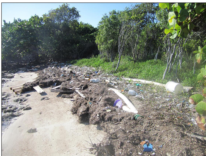
Figure 5: Before and After Beach Cleanup at a National Park