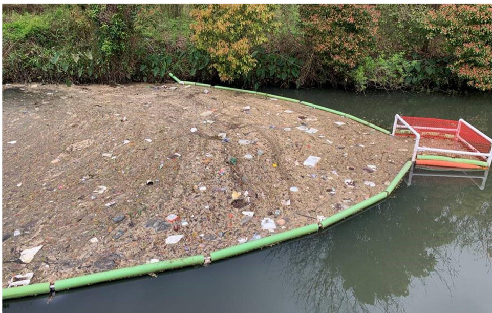
Figure 3: Trash Capture Device to Prevent Debris from Entering Waterway

GAO-19-653