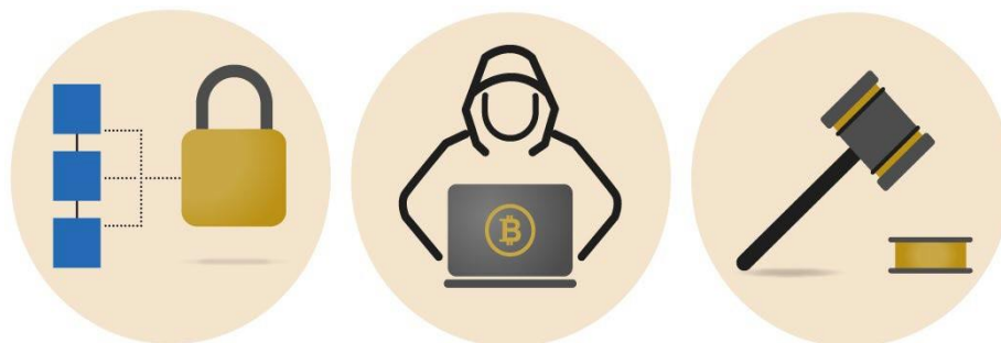
Figure 3. Permanence and lack of transparency and regulation raise concerns about adoptability.

This document is not an audit product and is subject to revision based on continued advances in science and technology. It contains information prepared by GAO to provide technical insight to legislative bodies or other external organizations. This document has been reviewed by the Chief Scientist of the U.S. Government Accountability Office.