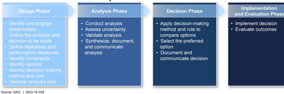
Figure: Phases and Steps of a Risk-Informed Decision-Making Framework to Address Environmental Cleanup Decisions

To assist agencies, such as DOE, in identifying and implementing the essential elements of risk-informed decision-making, GAO synthesized key concepts from relevant literature and input from experts who participated in GAO's meeting convened by the National Academies of Sciences, Engineering, and Medicine (National Academies). GAO subsequently developed a framework to be relevant to multiple types of cleanup decisions, from selecting a cleanup approach at a single site to prioritizing cleanup activities across sites. According to literature, entities implementing the framework should ensure that their decision-making process is participatory, logical, transparent, and traceable, and that it uses current scientific knowledge to produce technically credible results. The framework consists of four broad phases: (1) designing the decision-making process, (2) analyzing different options, (3) deciding which option is preferred, and (4) implementing and evaluating the preferred option. Each phase consists of several steps, such as identifying stakeholders, developing an analysis plan, and validating the analysis (see figure).