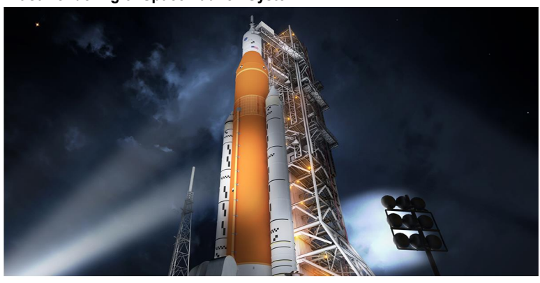
GAO-19-716T

GAO's past work has identified a number of lessons that NASA can apply to improve its management of its human spaceflight programs. For example, NASA should enhance contract management and oversight to improve program outcomes. NASA's past approach in this area has left it ill-positioned to identify early warning signs of impending schedule delays and cost growth or reap the benefits of competition. In addition, NASA's approach to incentivizing contractors through contract award fees did not result in desired outcomes for the SLS and Orion programs. Further, NASA should minimize risky programmatic decisions to better position programs for successful execution. This includes providing sufficient cost and schedule reserves to, among other things, address unforseen risk. Finally, realistic cost estimates and assessments of technical risk are particularly important at the start of an acquisition program. But NASA has historically provided little insight into the future cost of these human spaceflight programs, limiting the information useful to decision makers.