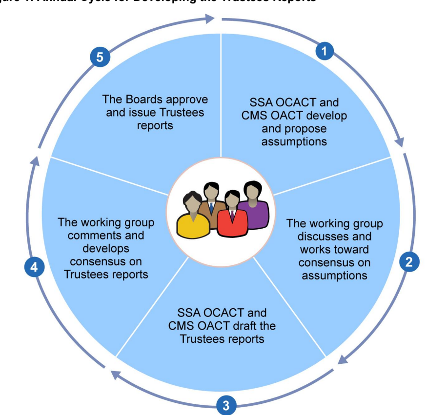
Figure 1: Annual Cycle for Developing the Trustees Reports

the Treasury serves as the Managing Trustee and Chairperson of the boards.<sup>8</sup> Treasury staff has historically coordinated the report development process, including organizing the development schedule and hosting the working group and boards' meetings. The reports are drafted by SSA and CMS.