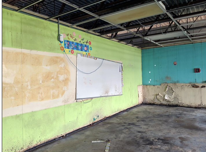
Classroom with molded floors and water damage on the walls at the Berwind Intermediate School in San Juan, Puerto Rico.

I GAO-19-594T