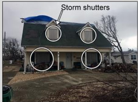
Some examples of hazard mitigation measures are house elevation, metal roofs, and storm shutters.

Source: GAO; photostaken by GAO while on site in Florida, I, GAO-19-594T