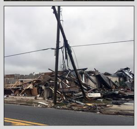
FEMA's Public Assistance program provides grants to repair public infrastructure such as water storage systems, roads, and power lines.