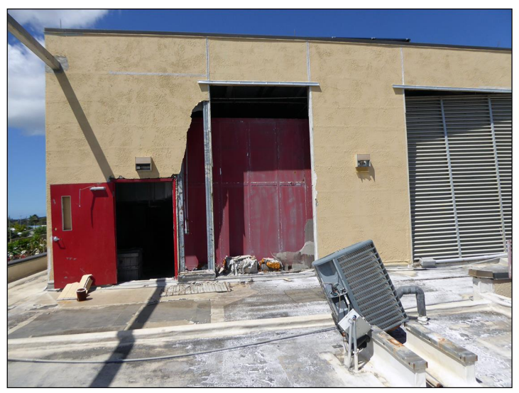
Figure 1: Hurricane Damage to a Hospital in the U.S. Virgin Islands and School in Puerto Rico