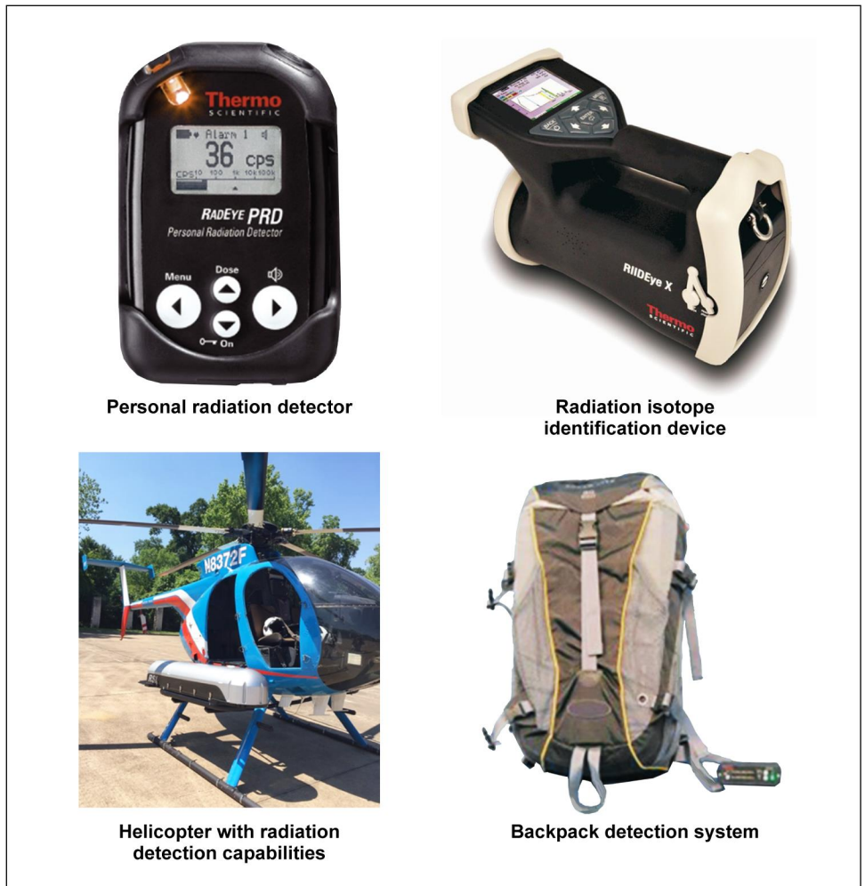
Figure 2: Photos of Types of Nuclear and Radiological Detection Equipment

Sources: Department of Homeland Security (top left, top right, and lower right photos); GAO (lower left photo). | GAO-19-327