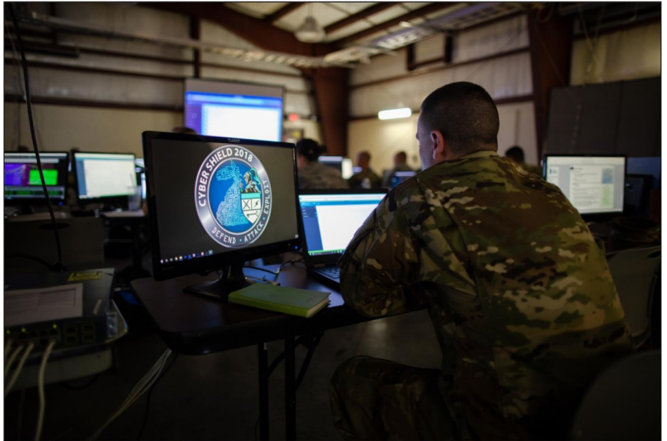
Figure 4: A Member of the National Guard Participates in a Cyber Training Exercise, 2018

GAO-19-362