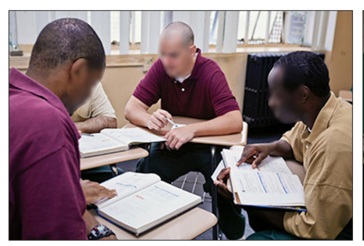
Figure 3: Incarcerated College Students inside New York's Sing Sing Correctional Facility and Taconic Correctional Facility for Women

Figure 3 shows incarcerated students taking college classes inside two New York prisons.