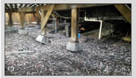
Damage to deck foundation of Station Vallejo's main office building

Station Vallejo is a boat station facility used to conduct maritime search and rescue and other Coast Guard missions. In 2014, an earthquake damaged Station Vallejo's components, including its foundations, piers, water lines, and doors.