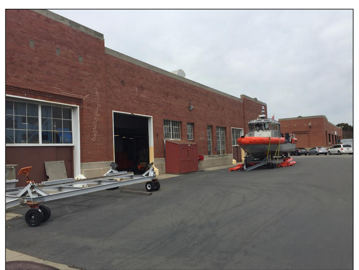
Figure 3: Coast Guard Maintenance Facilities Requiring Refurbishment Because They Cannot Accommodate Newer, Taller Boats

and meeting minutes. Furthermore, officials could not explain why certain documentation was not maintained to demonstrate how the Coast Guard had made and prioritized funding decisions. Such documentation may allow the Coast Guard to show, for example, why repairing a station they previously wanted to close is a higher priority than fixing a station they appear to need to perform maintenance on certain assets (see fig. 3).