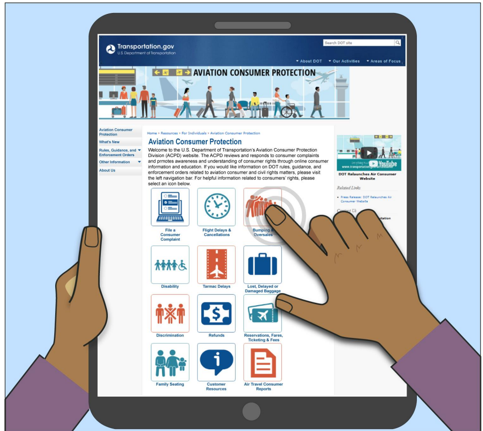
Figure 3: The Department of Transportation’s Updated Aviation Consumer Protection Website

Sources: GAO and U.S. Department of Transportation, 2 May 2018. Web. | GAO-19-76