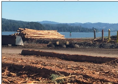
Logs at an Export Facility; Logs on a Truck