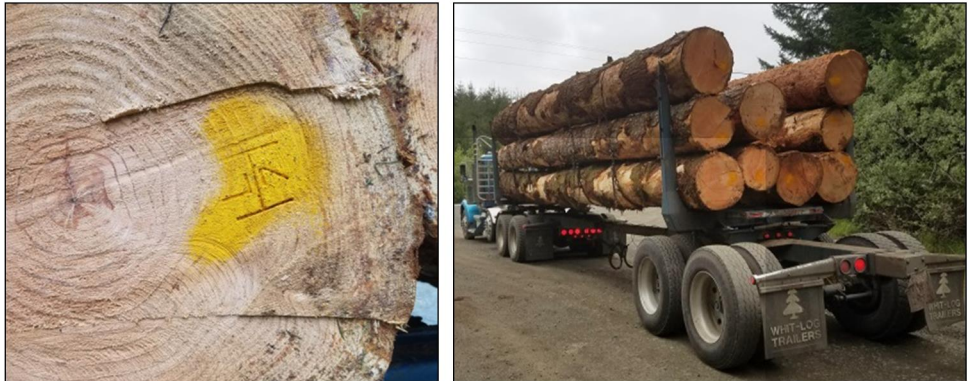
Figure 2. Federal Logs Marked With Yellow Paint and Hammer Brands

Source: Bureau of Land Management. | GAO-18-593