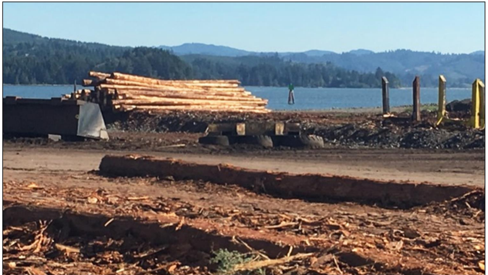
Figure 3: Unprocessed Logs at an Export Facility