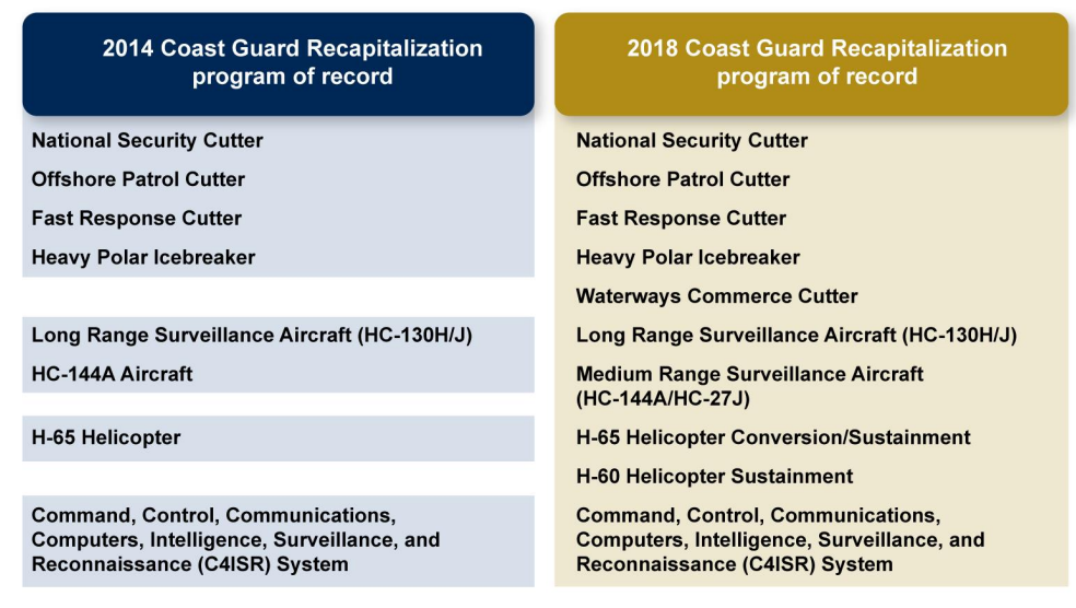
Figure 1: Coast Guard Major Acquisition Portfolio in 2014 and 2018

GAO-18-454