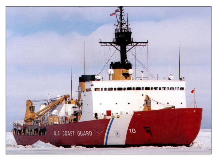
Figure 7: The Coast Guard's Icebreaker Polar Star

capability—the ability for one icebreaker to rescue the other if it became incapacitated while performing icebreaking operations.