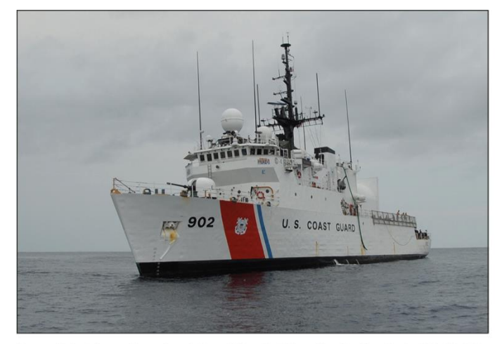
Figure 8: The Coast Guard's 270-Foot Medium Endurance Cutter

The Coast Guard operates two fleets of Medium Endurance Cutters (270-foot and 210-foot cutters) and both are either approaching or have exceeded their design service lives. According to Coast Guard maintenance officials, the primary problem facing the 270-foot Medium Endurance Cutters is obsolescence given the age of these cutters. The cutters have several systems that are no longer manufactured, and in many cases the original manufacturer no longer makes parts for the systems, such as the generators, fire pumps, and main diesel engines. In order to sustain the 270-foot Medium Endurance Cutters until the Offshore Patrol Cutters—replacements for the Medium Endurance Cutters—are delivered, the Coast Guard is planning to conduct a SLEP. Officials stated they are evaluating how many of the 13 cutters will undergo the SLEP. The Coast Guard does not have a cost estimate for the SLEP, but officials said that the project should enter the obtain phase and complete its first cost estimate by June 2019.