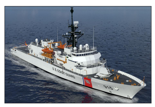
GAO-18-454

In response to a September 2012 GAO recommendation, the Coast Guard updated the Executive Oversight Council's (EOC)—a cross-directorate group that oversees major acquisition programs—charter in 2014 to require annual reviews of the acquisition portfolio collectively. However, EOC officials said that these annual reviews never occurred, and GAO found that the annual review requirement was removed from the charter in 2017. Thus, the Coast Guard is without a senior-level group charged to collectively review and ensure affordability of its acquisition portfolio. The Office of Management and Budget's Capital Programming Guide states that a senior-level executive committee should be responsible for reviewing the agency's entire asset portfolio and for making decisions on the proper composition of assets needed to achieve strategic goals within budget constraints.