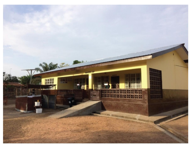
Figure 8: Community Health Center in Sierra Leone Rehabilitated by a USAID Ebola Recovery Project