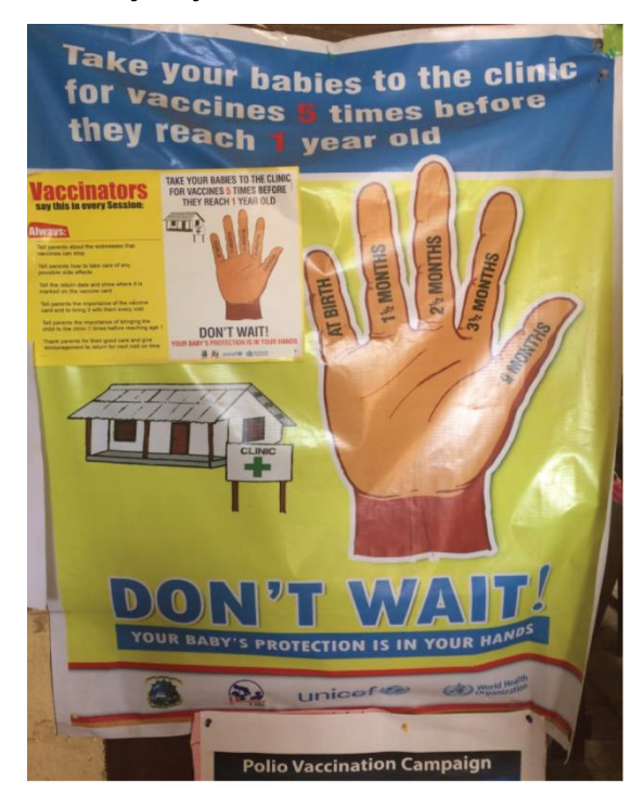
Figure 7: Vaccination Poster at Health Clinic in Liberia Provided by a USAID Ebola Recovery Project

displayed at a health facility supported by the project to inform mothers about the importance of child immunizations. In addition, the bureau approved an extension of 3 months for a project to refurbish health facilities and improve access to maternal and child health services in Sierra Leone. Figure 8 shows a refurbished health facility supported by the selected project. According to project staff, the project had experienced delays in completing renovation activities—such as installing water towers and pumps and drilling boreholes to meet the health facilities' water needs for infection prevention—because of challenges in locating suitable sites for drilling at health facilities and the rainy season. Figure 9 shows a water well installed at a health facility supported by the selected project.