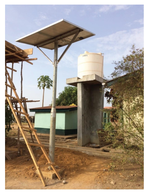
Figure 3: Solar Panel at a Health Facility in Sierra Leone Installed as Part of a USAID Ebola Recovery Project