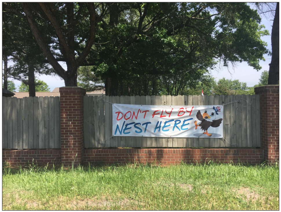
Figure 2: Advertisement Seeking Tenants for Privatized Housing