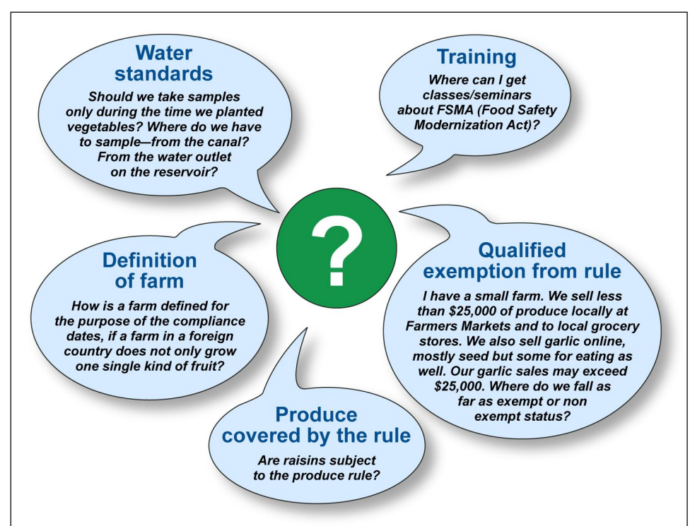
Figure 3: Examples of Questions about the Produce Rule Submitted by Businesses to the Food and Drug Administration's Technical Assistance Network

from FDA about implementing the produce rule.<sup>20</sup> Examples of questions about the produce rule that were submitted by businesses are shown in figure 3.