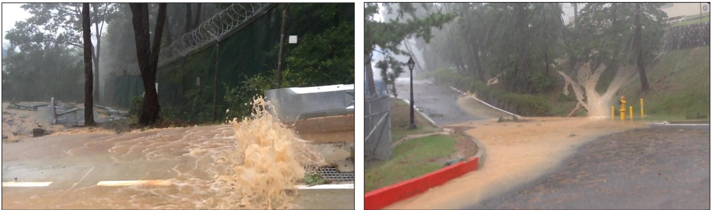
Figure 9: 2010 and 2014 Rainstorms Overwhelmed the Drainage System at a Department of Defense Installation in the Pacific

GAO-18-206