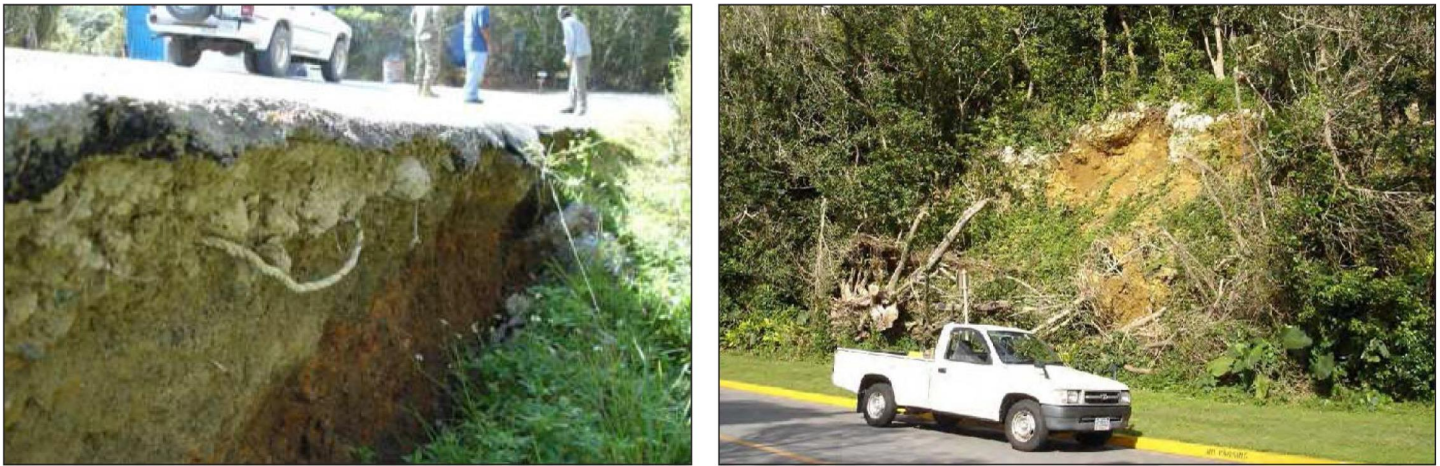
Figure 6: Erosion along Roads at a Department of Defense Training Range in the Pacific

Source: Department of Defense. | GAO-18-206