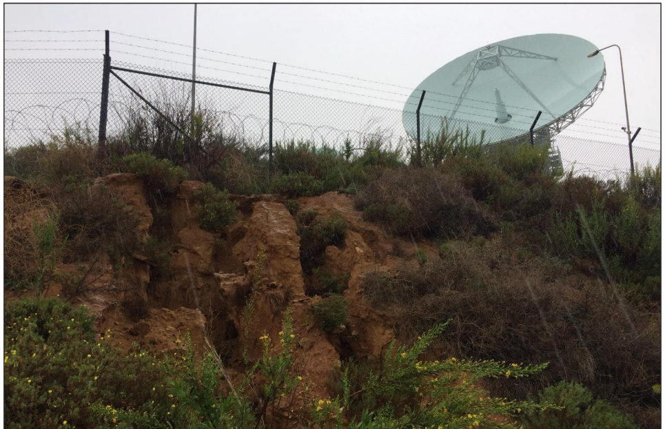
Figure 7: Hillside Impacted by Erosion at a Department of Defense Installation in Europe