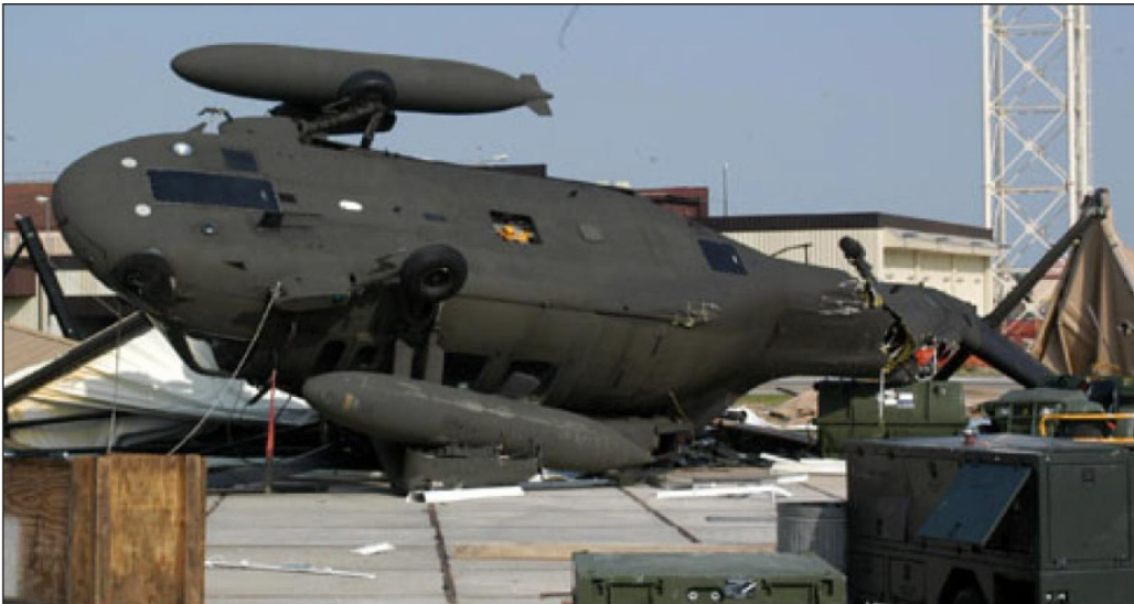
Figure 5: Helicopter Damaged by an Extreme Wind Storm at a Department of Defense Installation in Europe

A 2006 storm required at least $3.5 million in facility repairs and severely damaged this helicopter at this installation. In previous work, we found that while it is not possible to link any individual weather event to climate change, the impacts of extreme weather events provide insight into the potential climate-related vulnerabilities faced by the Department of Defense.