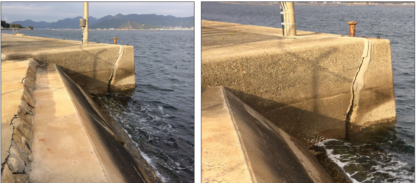
Figure 10: Damaged Seawall at a Department of Defense Ammunition Depot in the Pacific

future rising sea levels and an associated storm surge, access to the depots may be limited during training and contingency operations, according to installation officials.