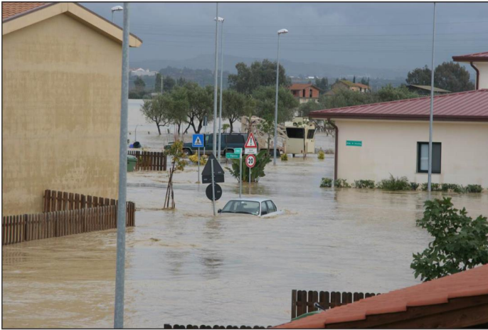
Figure 1: Flooding on Roads and in Facilities (Left) and Mud Covering the Ramp of a Runway (Right) at a Department of Defense Installation in Europe