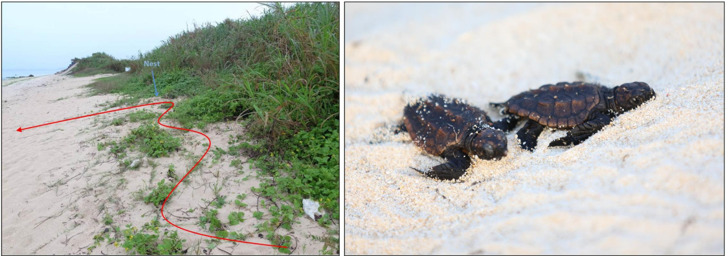
Figure 8: Movement of Sea Turtles across a Department of Defense (DOD) Beach, Indicated by Arrows (Left) and Sea Turtle Hatchlings (Right), at a DOD Installation in the Pacific

unavailable for training activities at the time of the turtles' nesting. 68 Illustrating this type of impact, officials from a DOD installation in the Pacific explained that they dedicated time to relocating the eggs of sea turtles from a section of the beach vulnerable to increasing storm surge (see fig. 8).