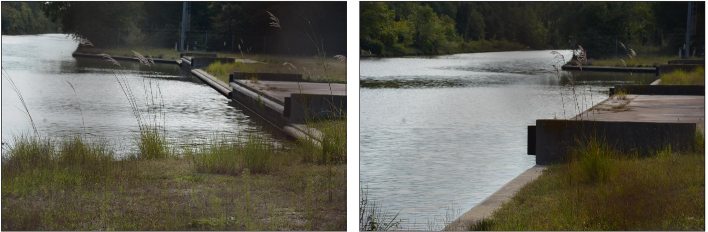
Figure 2: Water Level of a Canal Adjacent to Ammunition Loading Docks at a Department of Defense Installation in Europe

Source: Department of Defense. | GAO-18-206