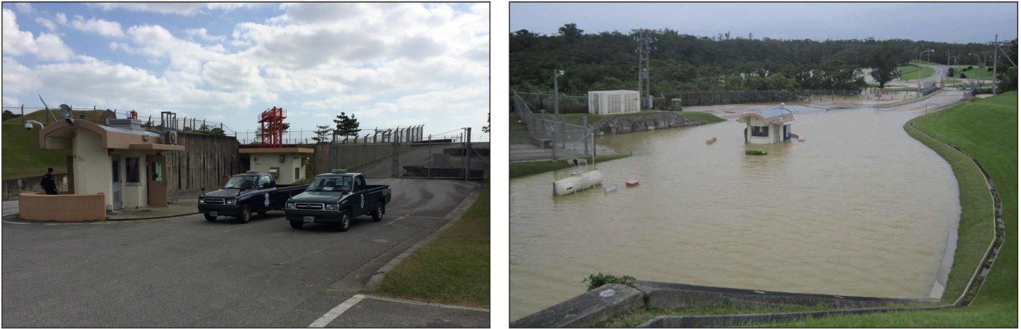
Figure 3: Security Checkpoint in Non-flood Conditions (Left) and During Flooding in 2014 (Right) at a Department of Defense Installation in the Pacific

Source: GAO and Department of Defense. | GAO-18-206