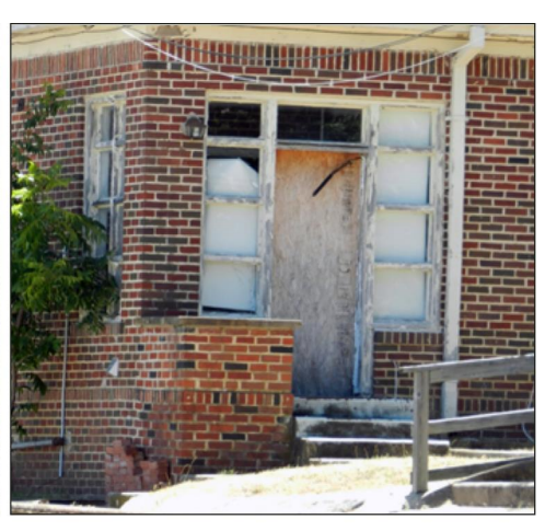
Exterior view of the building shows broken windows and missing bricks.

Note: Kerrville VA Medical Center, Kerrville, Texas: These pictures show a dwelling formerly used for medical staff housing that has been designated as a historic building. The outside of the building shows broken windows, missing bricks, and gutters that have nearly detached from the building. On the inside, portions of the ceiling have collapsed, spraying debris onto the floors and walls.