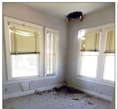
Interior damage of Kerrville Medical Center.