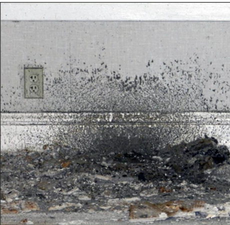
Portions of the ceiling have collapsed, spraying debris on to the floors and walls.