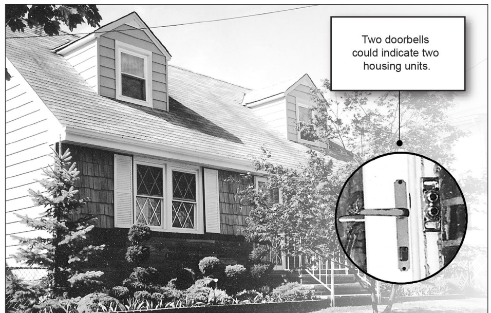
Figure 2: Single or Multi-unit Housing?

The Bureau faces an additional challenge of locating unconventional and hidden housing units, such as converted basements and attics. For example, as shown in figure 2, what appears to be a small, single-family house could contain an apartment, as suggested by its two doorbells. If an address is not in the Bureau's address file, its residents are less likely to be included in the census. 4 The Bureau estimated a net undercount of 790,000 housing units in 2010.