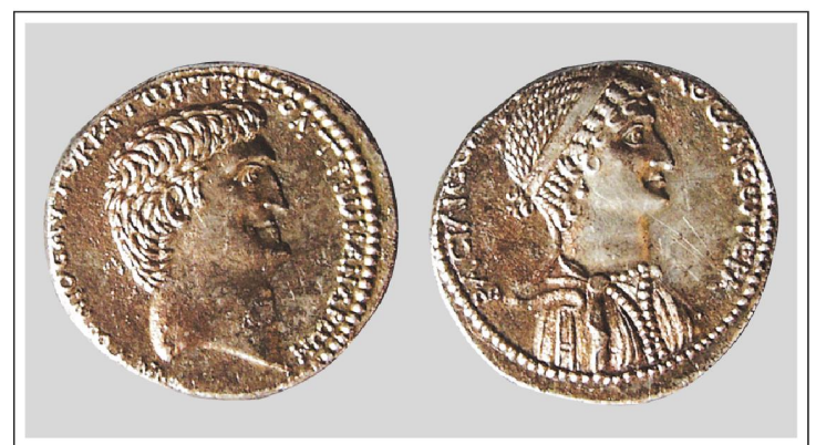
Silver coin with Mark Antony and Cleopatra VII, 40 - 31 BC

Source: International Council of Museums (ICOM). \mid GAO-16-673