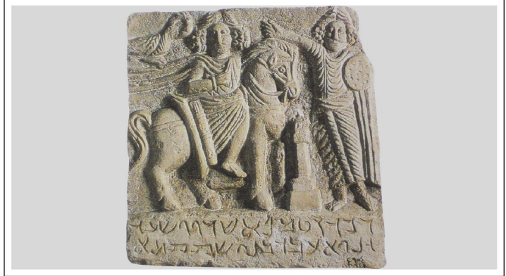
Gypsum low relief from Dura-Europos, 1st - 2nd century AD © National Museum of Damascus

Source: International Council of Museums (ICOM). \mid GAO-16-673