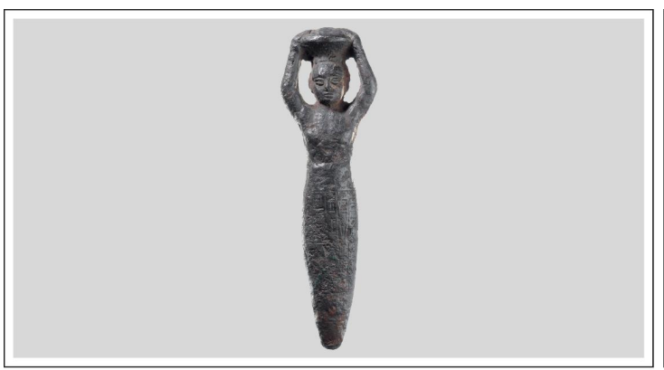
Figure 4: Types of Iraqi Items at Risk of Being Trafficked

Bronze foundation element figurine, 3rd millennium BC