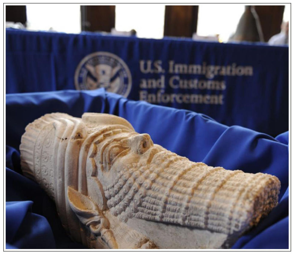
Figure 9: Example of an Iraqi Item That Was Smuggled to the United States, Where It Was Seized and Repatriated by U.S. Homeland Security Investigations in March 2015

Source: U.S. Immigration and Customs Enforcement (ICE), Office of Homeland Security Investigations. | GAO-16-673