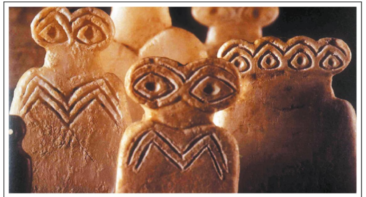
Figure 5: Types of Syrian Items at Risk of Being Trafficked