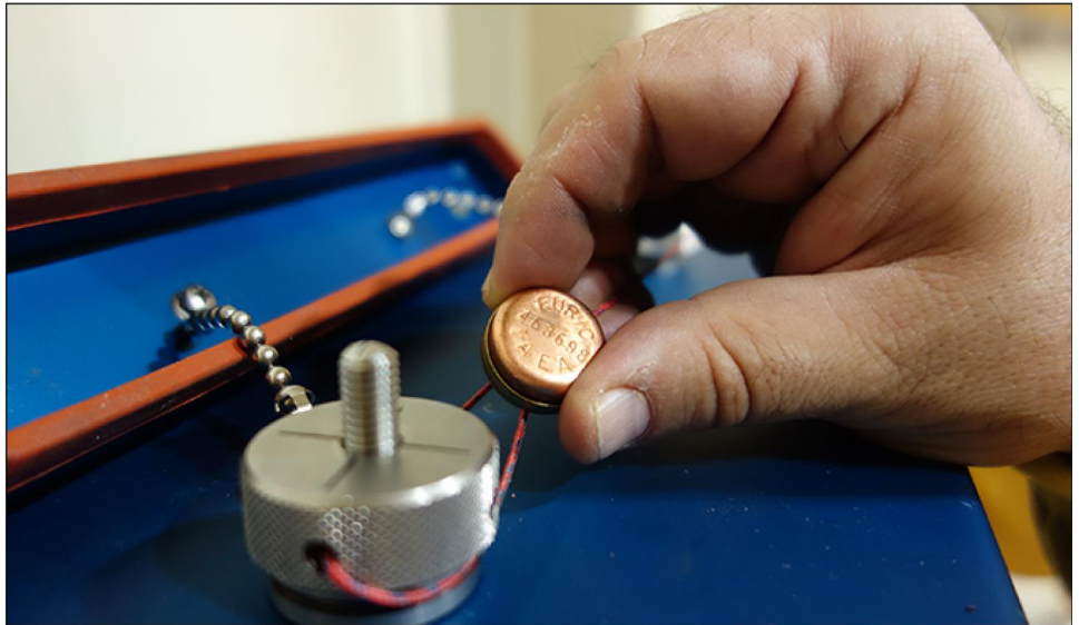
Figure 3: An Inspector Replaces a Seal

GAO-16-565