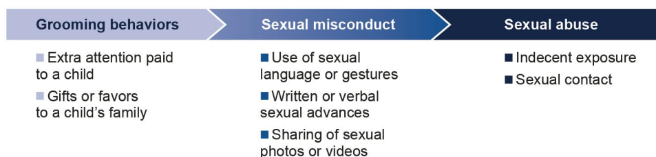
Figure 2: Continuum of Possible Behaviors by Perpetrators of Child Sexual Abuse