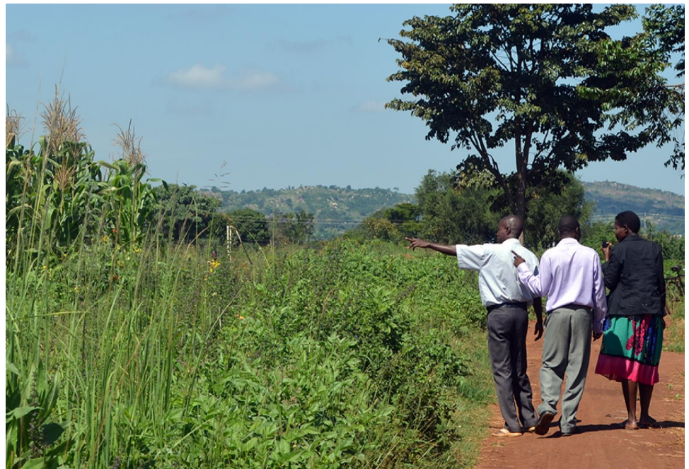
Figure 1: F2F Beneficiaries Touring a Field Where Maize Is Being Cultivated

Congress first authorized the F2F program in the 1985 Farm Bill to provide for the transfer of knowledge and expertise of U.S. agricultural producers and businesses to middle-income countries and emerging democracies on a voluntary basis. Most recently, Congress reauthorized the program in the 2014 Farm Bill. Congress has authorized the F2F program to provide a broad range of U.S. agricultural expertise using U.S. volunteers. The 2- to 4-week volunteer assignments are designed, among other things, to improve farm and agribusiness operations and agricultural systems, field crop cultivation, fruit and vegetable growing, livestock operations, marketing, and the strengthening of cooperatives and other farmer organizations (see fig. 1).