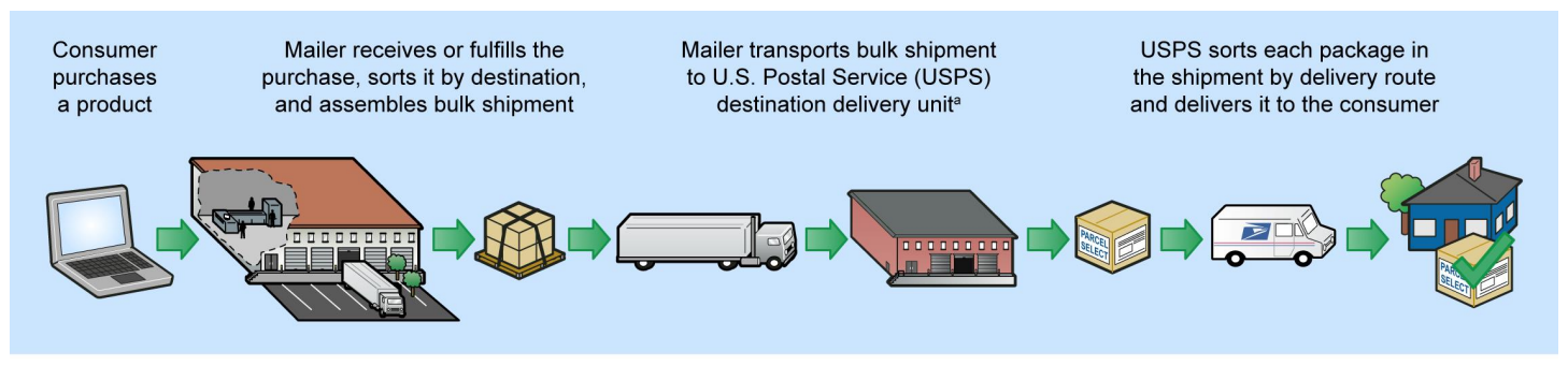
Figure 2: Package Delivery Flow under Parcel Select Negotiated Service Agreements

Shipping packages under Parcel Select lowers mailers' delivery costs by allowing them to enter bulk shipments of packages into USPS's network—generally at Destination Delivery Units (DDU)<sup>17</sup> that are located close to the final delivery point (see fig. 2). As a result, these packages generally bypass most of USPS's mail processing and transportation network. Prices vary, depending on package weight, entry point, and the total volume shipped.